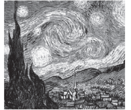
VINCENT VAN GOGH'S FAMOUS STARRY NIGHT

So, the Starry Starry Night. It's time to get out and stare at those shiny little things; time to let our minds go far beyond the scientific facts. Before we face to the solitude; before we feel helpless. There is no way that we lose the means of finding the hopes within the universe as the beauty of the night sky is endless. So, for our own Starry Starry Night, I hope you all will join.